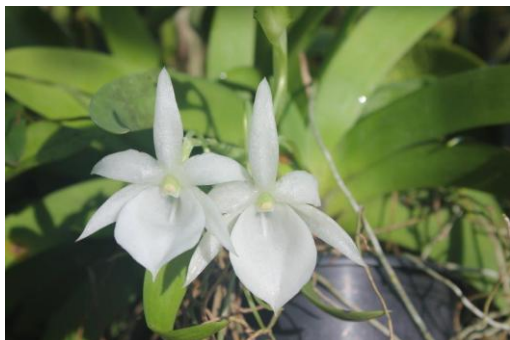
Angraecum leonis .